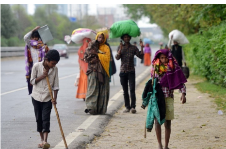
Migrant laborers walking hundreds of miles back to their native places

We are doing well here at GFA, and are so grateful that during the time of lockdown we were still able to support the work of our brothers and sisters in Asia. In no way do we want to belittle the loss of life and economic struggle in our nation, even affecting many of you reading this newsletter, but we are also burdened by the enormous toll brought upon the people of Asia by the necessary