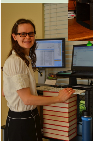
Home desk set-up

So on that Thursday morning, the normal stream of people heading from our homes on campus into the admin building did not occur. Some of the staff did have to go to the office: Fulfillment and some of the Donor Services processes were considered “essential services” and could not be moved to a home environment. The majority of us, however, logged into our computers from our bedrooms, dining rooms, and front porches. Both of us brought various computer equipment from the office to build our “home desks,” and